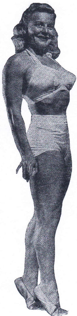
Physical Culture Venus 1948