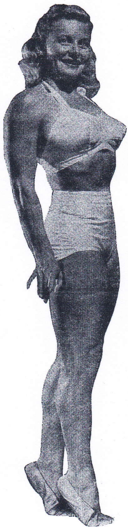
Physical Culture Venus 1948